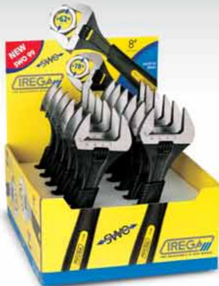
SB 12 piece 8" Merchandiser SBB 24 piece 8" Merchandiser