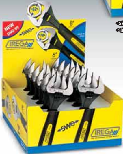
SB 12 piece 6" Merchandiser SBB 24 piece 6" Merchandiser