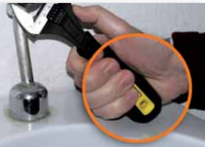
ErgoTop grip minimizes the risk of accidental damage to fine surfaces