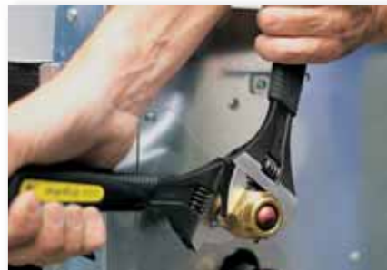
Special design to work torque / counter-torque on reduced and compact areas