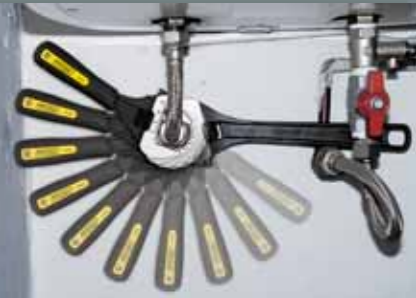
Ideal for use in confined spaces

50% lighter than standard adjustable wrenches (12") which has smaller opening!