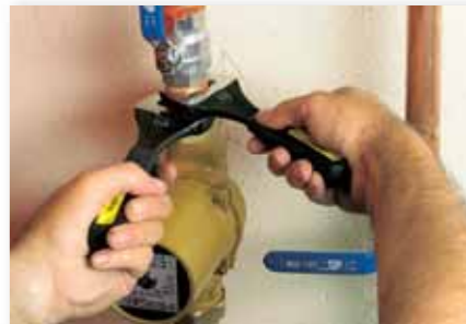
Thanks to its Super Wide Opening and slim jaw profile, the IREGA SWO model performs where standard adjustable wrenches do not