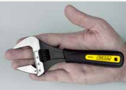
Lightweight and compact adjustable wrench.