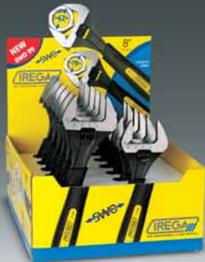
SBM Assorted Merchandiser (6 pieces 6" and 6 pieces 8") SBBM Assorted Merchandiser (12 pieces 6" and 12 pieces 8")